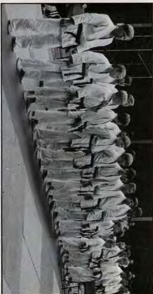
★ Above: Finnish National Under-18 Squad.