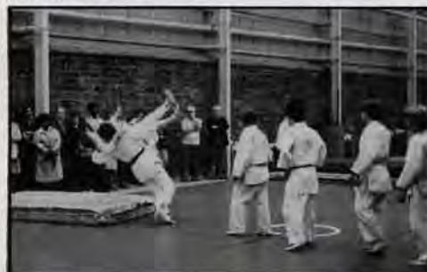
Above: Skill training with a crash mat and an audience of interested parents.