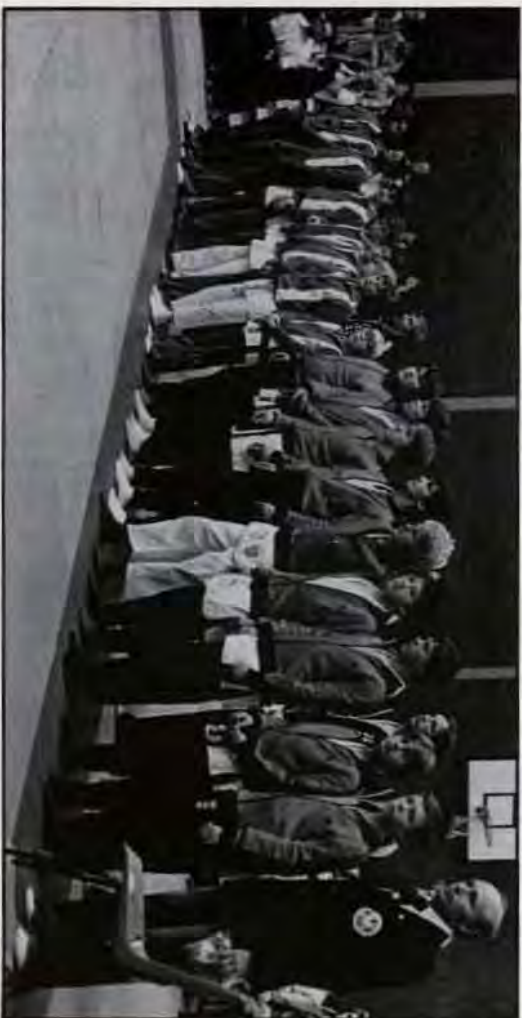
★ THE BSJA Under-18 Squad.