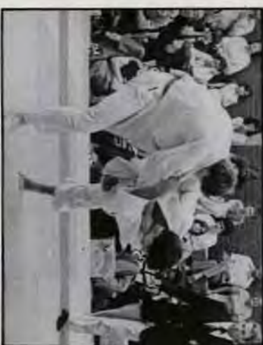
★ Below: Landrecombe of the BSJA attacking Makkonen of Finland.