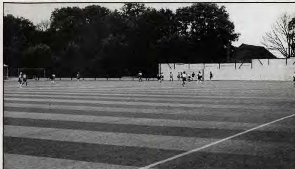
Above: How's that for a lawn? The new Poligrass playing area at Lilleshall.