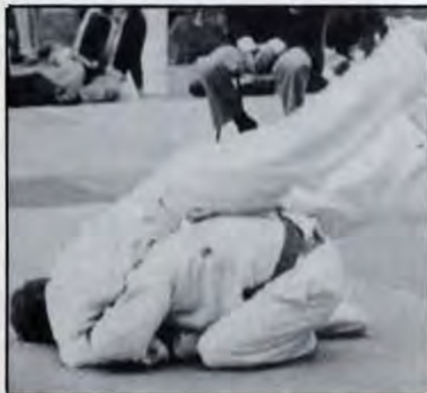
Top Left: (Morote) SEOINAGE. Above: SEOITOSHI.

Another two techniques with similar names with one throw being useful as a continuation from the other. Below is a picture of a drop-knee Seoinage being used in the British National Championships which failed to score. Ask your Coach why the two techniques above are more likely to get higher scores. Find out what 'Jack-up' techniques are.