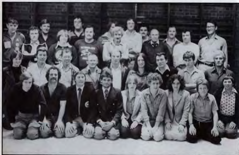
SOME OF THE MEMBERS AT THE IJF RULES SEMINAR. MIDLAND ARTS CENTRE 9th SEPTEMBER

This we have done and the Area Committee and the Clubs concerned express their grateful thanks for this welcome assistance.