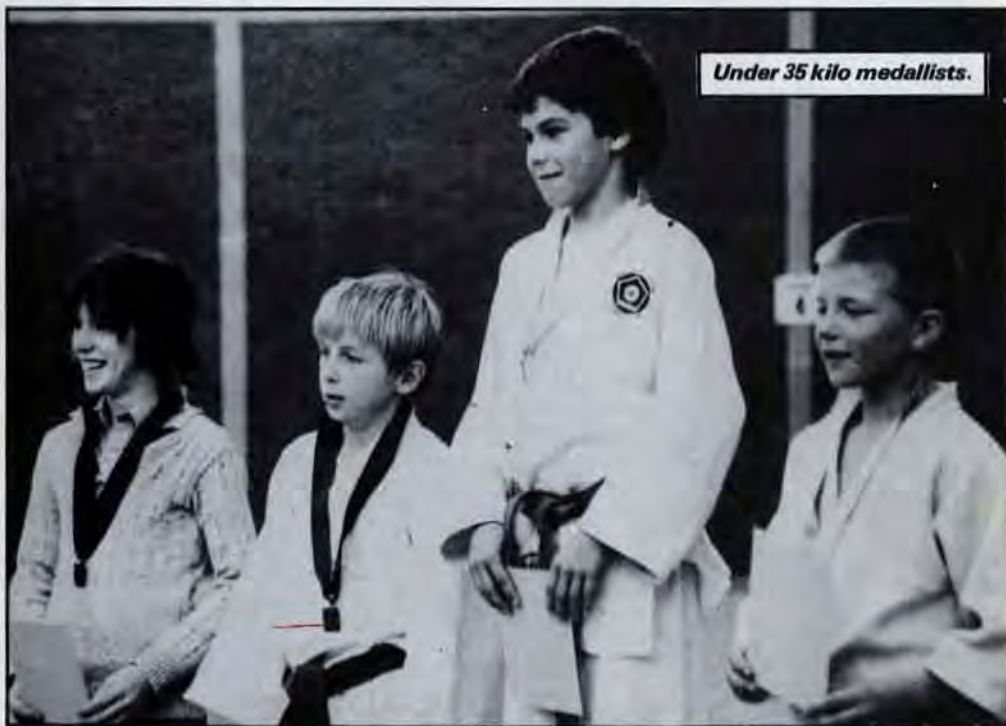
Under 35 kilo medallists.

Many thanks to everyone who helped to make the Event run so smoothly.