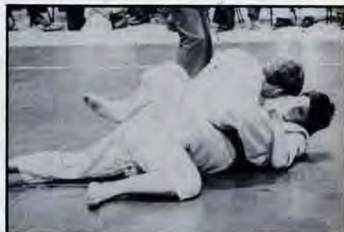
Derby Open . . . Action