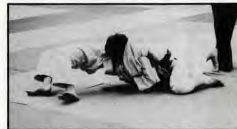
Unsuccessful 'bridge' attempt to escape from hold-down.

The contest was fought in the usual ten weight categories with very large numbers of entries in the three lightest weights and seeding confined to last years medallists and club separation in the first round only. That the Event went so well