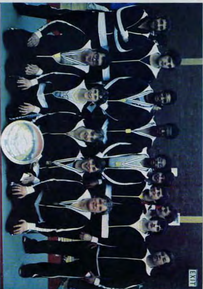
NATIONAL TEAM CHAMPIONS 1980

THE MAGAZINE OF THE BJA MIDLAND AREA * Volume 2, Number 10, June 1980