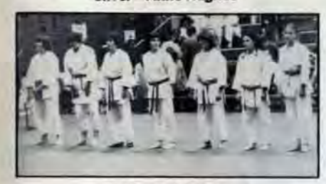
Midlands 'B' Team