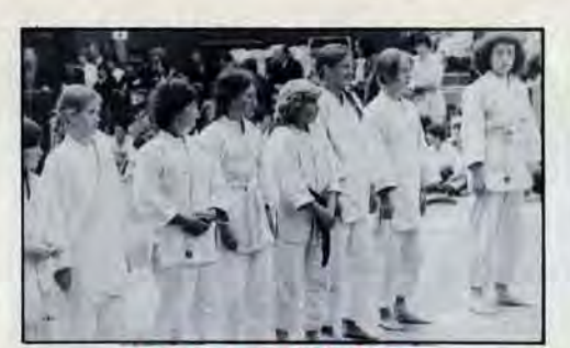
Leicestershire Girl's Team