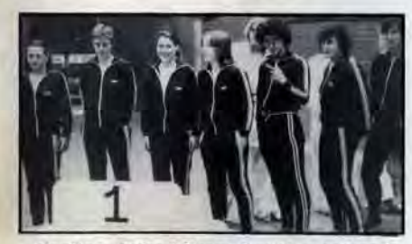
Northern Ireland Team first time entered