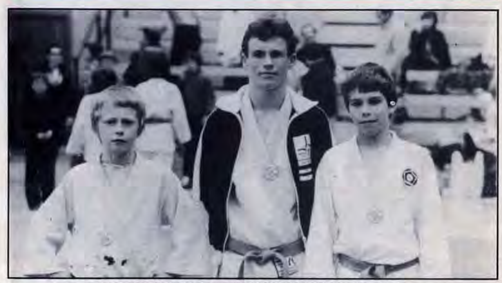
MIDLAND BOYS IN THE ENGLISH SCHOOLBOY'S TEAM

Referees have the most difficult job of all to control fights, but never again will I criticise the Midland Area Officials after witnessing the 'antics' of their counterparts at this Event.