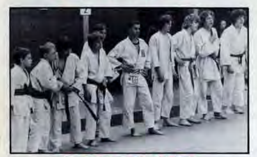
West Midlands Boy's Team