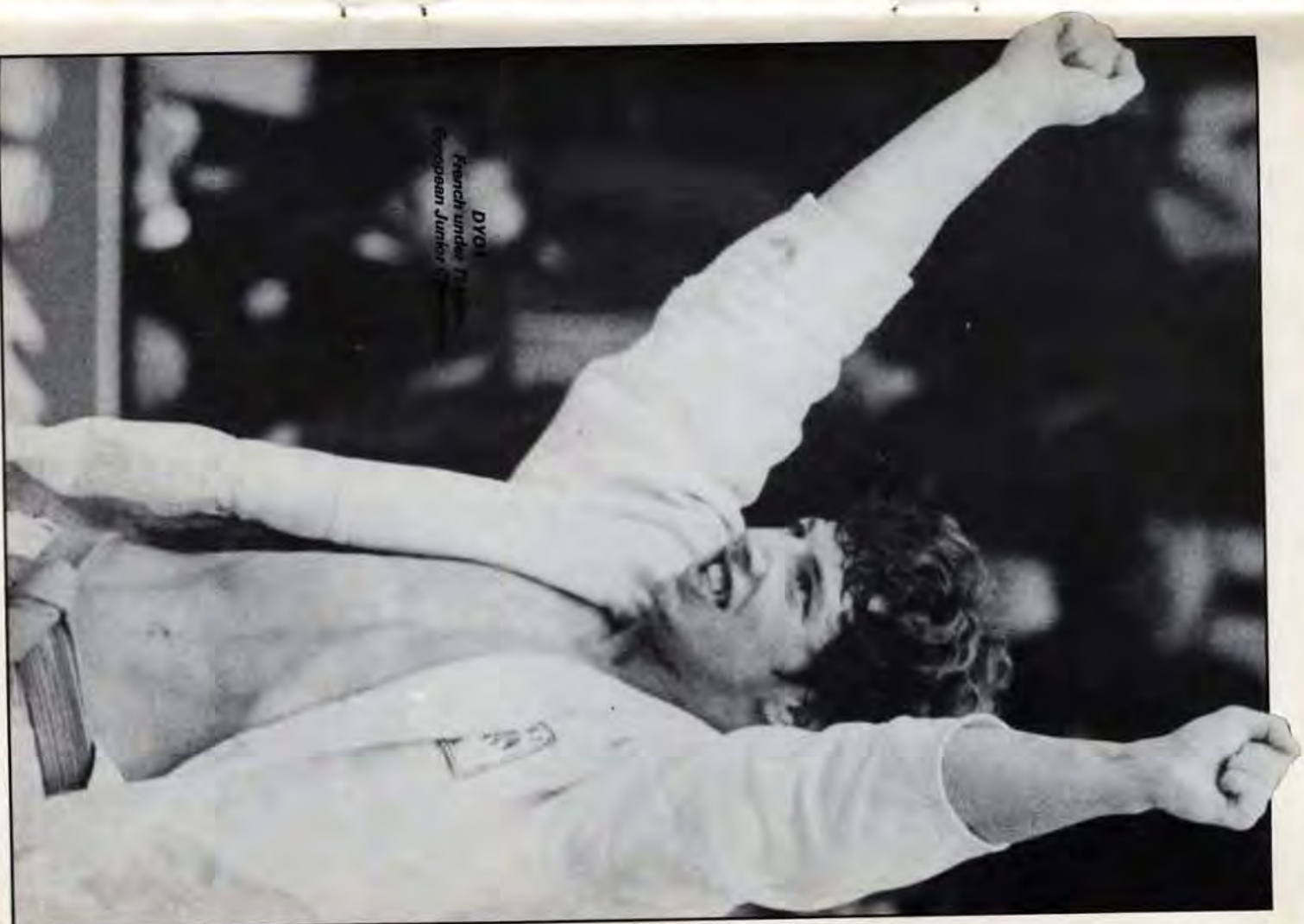
DOYOT French under 71k European Junior