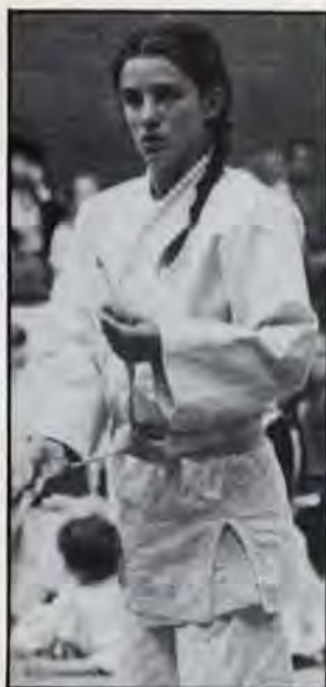
'PEB' JOHNS Tokai